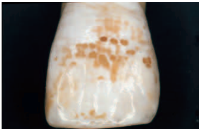
Fig 2 Severe fluorosis (TF-Index grade 7)