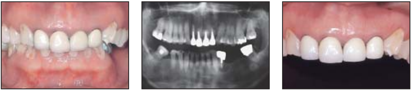
Figs 1a to 1c Clinical and radiographic appearance of a 55-year-old woman who presented with esthetic and masticatory disturbances.