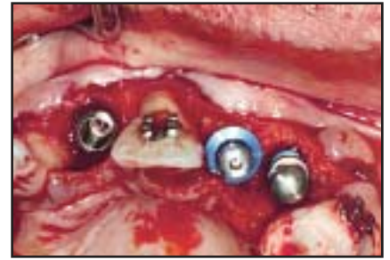
Fig 2c Implants were placed at the time of extraction in the areas of the right central incisor, the left lateral incisor, and the left canine. The left central incisor was kept to serve as an abutment during provisionalization and for the RST.