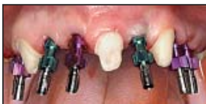
Fig 3 Patient 3.