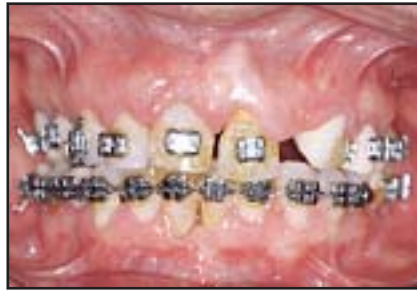
Fig 2b Clinical view following orthodontic extrusion of maxillary incisors to improve vertical hard and soft tissue support prior to implant placement. Correction of the underlying malocclusion was also achieved.