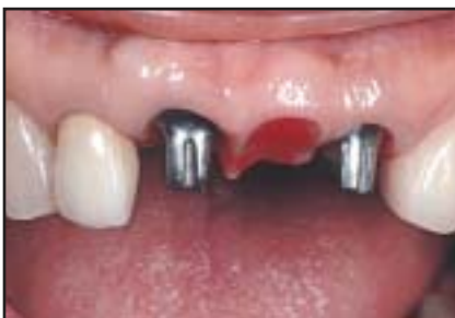
Fig 1g (above left) The pontic site shows excellent shape owing to the submerged root.