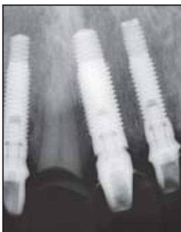
Fig 3a (far top) Multiple implants in the maxillary arch. The right canine, left central incisor, and left first premolar, which were vital but hopeless, were maintained only for the provisional phase.

Fig 3b (far bottom) The roots of the three remaining teeth were submerged using the RST, and additional soft tissue was grafted over the top.