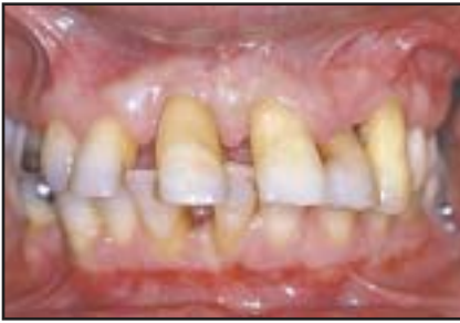
Fig 2a The patient presented with severe periodontal attachment loss and malocclusion.