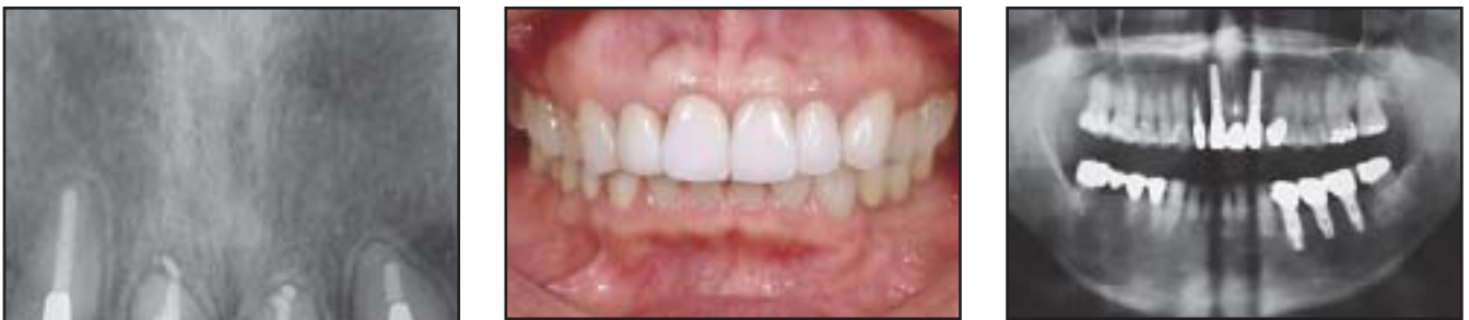
Fig 1d (left) Periapical radiograph of the anterior teeth after orthodontic therapy. Both central incisors and the left lateral incisor were planned to be replaced by an implant-supported restoration.